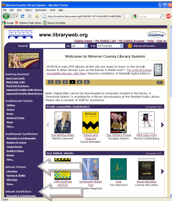
A screenshot of the OverDrive start page. The ebook collection can be browsed or searched from this page.